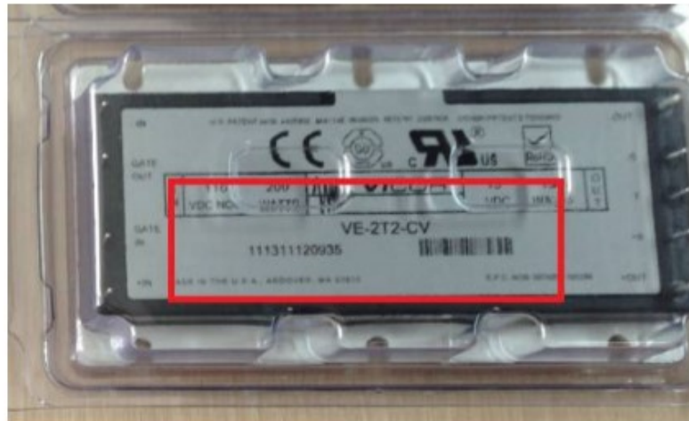
Fig 2. Interim label