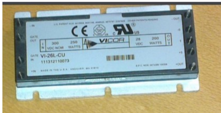
Fig 3. Final label