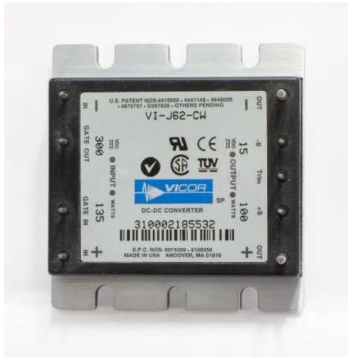
Figure 4 – Old label