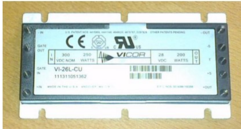
Fig 1. Old label